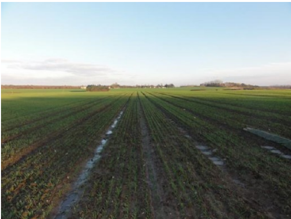
Figure 2. Water standing in compacted wheel tracks in spring.